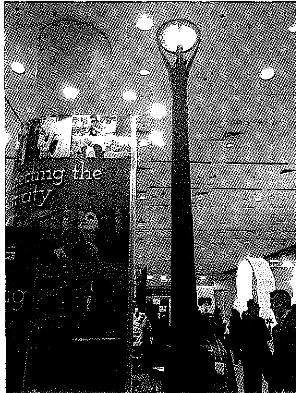
Full cut off street light with a small cell hidden inside.